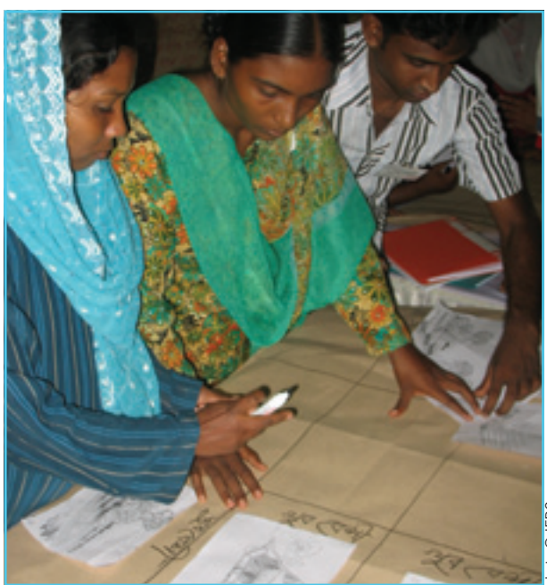
Participatory design in Bangladesh

Participatory design can also be used to design other community buildings, such as community centres, schools; health centres; markets or commercial areas; workshops; communal water and sanitation blocks, etc. This is closely linked with participatory planning (see PCR Tool 7: Planning with the People ), and is best done immediately after, or even during, the planning process. Whilst planning is mainly concerned with settlement layout, the provision of infrastructure, and the position of house plots, participatory design will