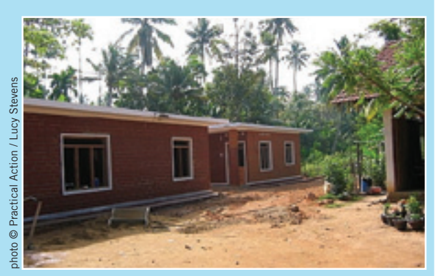
The owners of these houses, built in Matara with support of Practical Action, were involved in participatory design. The owner of the left house was able to add some of his own resources and build a slightly bigger house; using CAD, it was easy to adjust the plans

The NGO Practical Action supported many coastal communities in South and East Sri Lanka in their recovery after the 2004 tsunami, through a multifaceted approach. The reconstruction of housing was a major component in that. Practical Action did not build houses itself, but supported households and communities, and smaller local NGOs working with them, to do so. In doing so, it raised people's awareness about house designs and elements that can help mitigate natural disasters, so that people themselves would give high priority to building houses that are considered safe. Participatory design was an important part of this process. The NGO organised meetings with coastal communities, and asked them to make drawings in the sand of how their houses looked like before the disaster, and to discuss these. Many people were able to make coherent drawings of their houses that were useful for the architects,