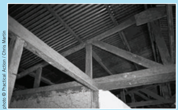
Community centre in Soritor during construction